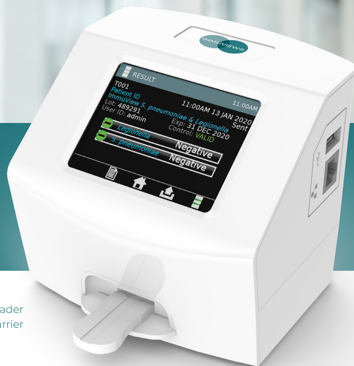
ImmuView® Reader and Strip Carrier

Objective interpretation of results eliminates operator subjectivity