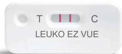
LEUKO EZ VUE®